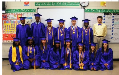
Hazlewood 8th Grade Graduates

Lawrence County has also been chosen to participate in the Instructional Partners Program . As a result, Instructional Coaches are present at our high schools and our middle schools. This allows instructional coaches, principals, and key staff to focus on instructional improvement. With the addition of this and the A+ College and Career Ready program, making us the first system-wide acceptance for a district into the grant program. Lawrence County is now one of two county school systems in