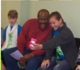
Art at Speake Moulton Middle at Stewart Center