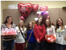
R.A.K. – Random Acts of Kindness – Group of young ladies who have made it a point to go out of their way to be kind to those around them.