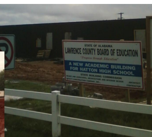
Moulton Elementary/Middle Cafeteria and Hatton High Academic Building